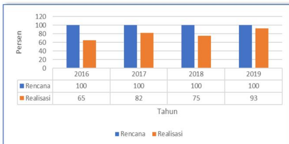
Figure 1. Realization of NPK Fertilization for Palm Oil Produced Plants

Procurement of fertilizers starts from the decline in fertilizer recommendations from research institutions, namely, the Palm Oil Research Center (PPKS). Fertilizer recommendations issued by PPKS are based on the results of leaf or soil analyses. Recommendations are provided in the form of alternative types and doses of fertilizers to be applied to oil palm plants. Based on the results of these recommendations, each PT XYZ, which has oil palm commodities, determines the type of fertilizer to be used for oil palm plants, including determining the amount of fertilizer needed. PT XYZ is a state-owned enterprise engaged in plantations with the main commodities of oil palm and rubber plants, paying great attention to fertilization to achieve optimal performance. One of the obstacles experienced by PT XYZ in NPK fertilization of Palm Oil plants on mature plants is the incompatibility of the fertilizer applied to the plan. This discrepancy can be seen in Figure 1, the realization from 2016 to 2019 on oil palm producing plants at PT XYZ as follows: