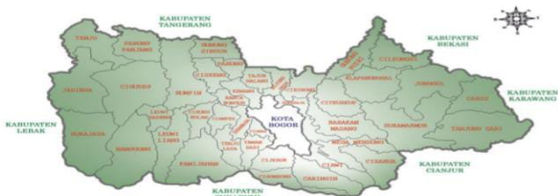
Figure 2. Map of District Administration, Bogor Regency

Bogor Regency is one of the areas directly adjacent to the capital city of the Republic of Indonesia and geographically it is located at the position of 6019' - 6047' south latitude and 10601' - 1070103' east longitude. The area based on the latest data is 2,301.95 Km 2 , with the following boundaries, (1) North: Depok City, (2) West: Lebak Regency, (3) East: Purwakarta Regency, and (4) South: Sukabumi Regency. Based on the results of the 2017 Socio-Economic Data Collection, Bogor Regency has 40 sub-districts, 427 villages / wards, 13,541 RTs and 913,206 households. Of these 234 villages have an altitude of less than 500 m above sea level (asl), 144 villages are between 500-700 m and the remaining 49 villages are around more than 500 m asl. Most of the villages in Bogor Regency have been classified as Swakarya villages, namely 236 villages, the other 191 are Swasembada villages and there are no Swadaya villages. Based on the regional classification, seen from the aspect of potential business fields, population density and social conditions, there are 199 urban villages and 228 rural villages.