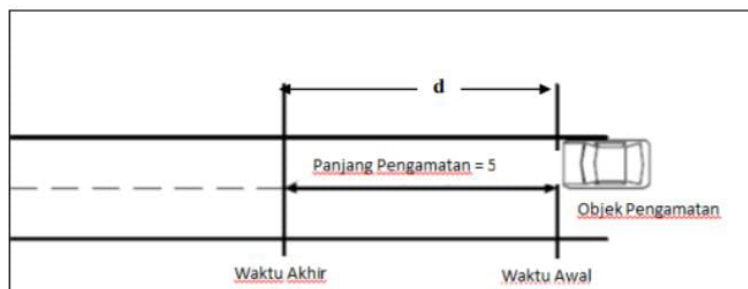
Figure 1. Spot Speed Survey Observation

The steps in observing the spot speed survey are: (1) Prepare survey equipment and forms to be used. (2) Determine the starting and ending points along the route as well as the points considered to be control points. (3) Activating the stopwatch when the vehicle passes the specified starting point. (4) Time and distance readings are made at the designated control point to indicate the vehicle has passed. (5) When a delay occurs or the vehicle is forced to move slowly, the stop time is recorded using the second stopwatch, the location or distance and the cause of the delay (numeric codes can be used to identify the cause of congestion). (6) Deactivate the stopwatch when it reaches the end point of the study route so that data will be obtained which will later be used during data analysis.